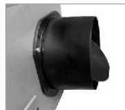
Plastic Backdraft Damper